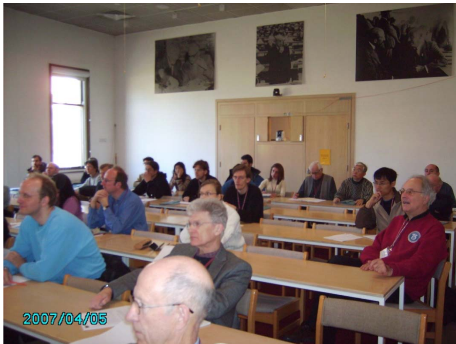
During a lecture, workshop April 10-15

Workshop “Graph Models of Mesoscopic Systems, Wave-Guides and Nano-Structures” 10 - 13 April 2007 at the INI was a logical continuation of the previous one, but with more applied tilt. It involved 52 participants (mathematicians, physicists and chemists) from Australia, Austria, Belgium, Czech Republic, France, Germany, Israel, Italy, Japan, New Zealand, Poland, Russia, Sweden, UK and USA , who delivered 23 lectures. The topics included in particular modeling newly discovered two-dimensional crystals (graphene), electronic transport in circuits of quantum wires, quantum graphs for quantum information transmission, quantum random walks, quantum chaos, graph models for the fast developing spintronics, models for slowing down light, and many others. As in the previous workshop (and even to a higher degree), active and often across the fields communication among participant was triggered.