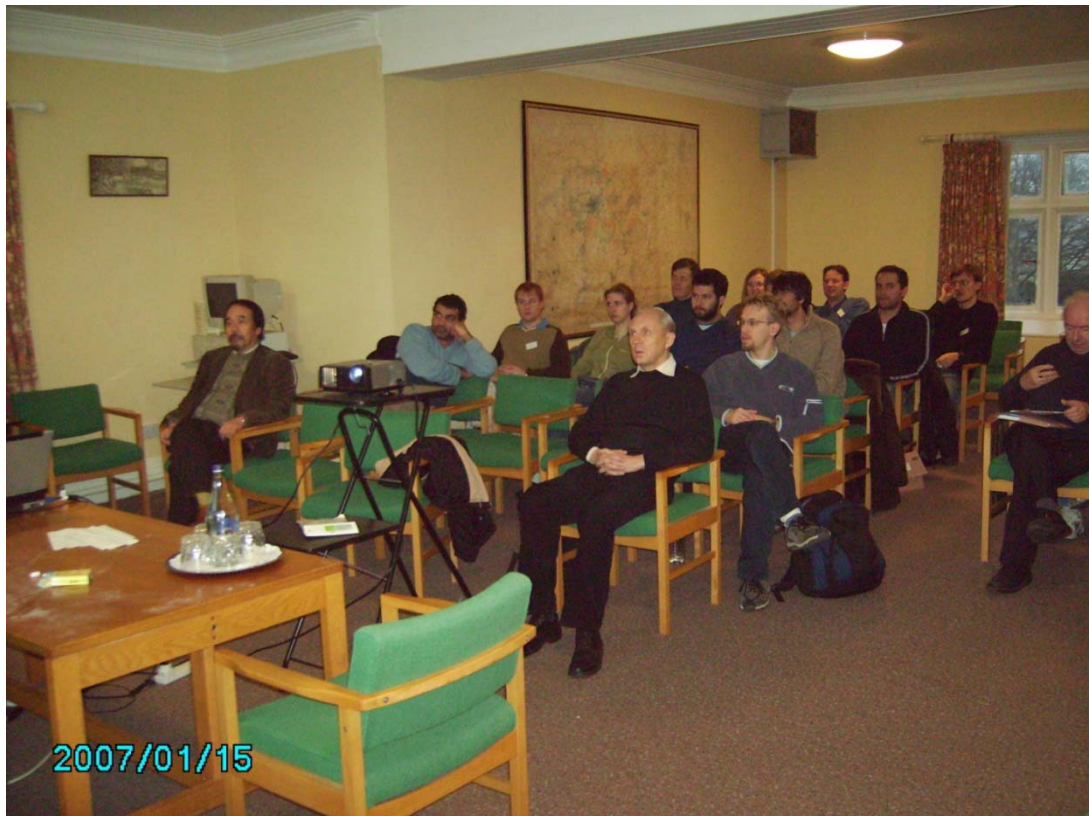
During a lecture in Gregynog

The tutorial “Analysis on graphs and other discrete structures” 10 - 15 January 2007 at Gregynog was devoted to introducing students and junior researchers, as well as a few more senior scientists interested in learning the subject, to the main structures and method available. The tutorial involved 37 participants (mostly graduate students and postdocs, as well as one undergraduate student) from Czech Republic, Israel, Japan, Russia, Switzerland, UK and USA. The following series of 16 lectures were given: Professor T. Sunada (Meiji Univ., Japan) - Spectral geometry of discrete Laplacians , Professors P. Kuchment (Texas A & M Univ., USA) and P. Exner (Prague, Czech Republic) - Quantum graphs and their applications , Professor A. Teplyaev (Univ. of Connecticut, USA) - Analysis on fractals . Two guest lectures were given by Professor U. Smilansky (Weizmann Institute of Science, Israel) - Spectral statistics and Professor A. Valette (Institut de Mathématiques, Switzerland) - Ramanujan Graphs