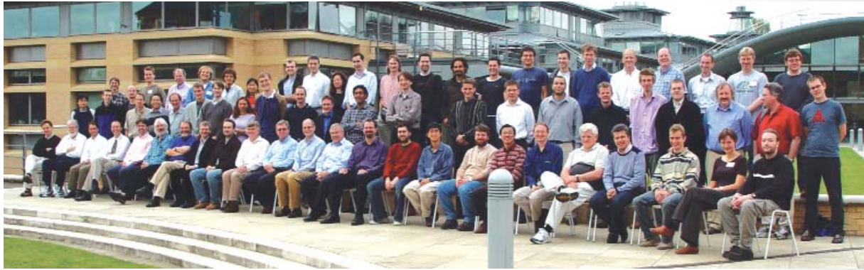
Participants at the 'Special Week on Quantum Cryptography'