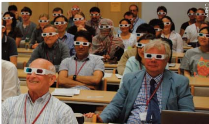
The audience were invited to wear 3D glasses to take full advantage of the time-lapse movie

The talk is available to watch at www.newton.ac.uk/seminar/20140623100010451