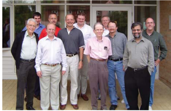
Some of the key participants