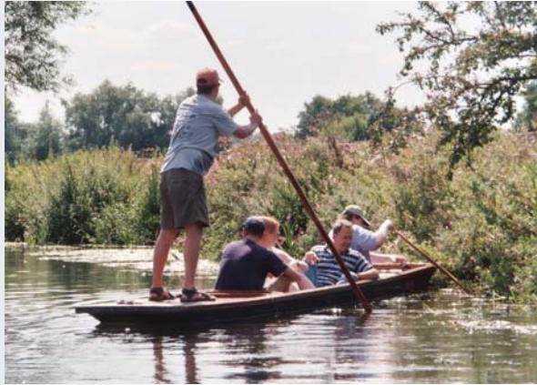
Relaxing – but not always going in the intended direction!

Then after tea J Dorelli gave a fascinating review of reconnection at the dayside terrestrial magnetopause and W Baumjohann described Cluster results on bifurcated and thin current sheets. The day ended with two contributed talks from S Eriksson on shock analysis of flows in the magnetotail and T Moretto on Cluster observations of the high-latitude magnetopause.